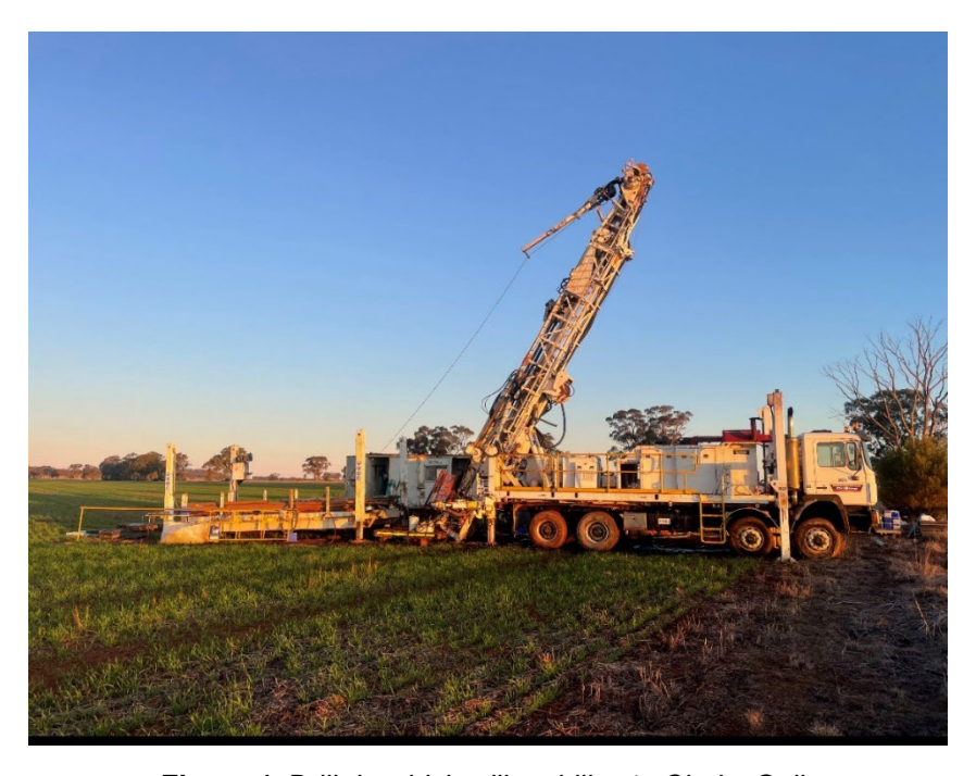
Figure 1. Drill rig which will mobilise to Clarks Gully

The drilling program will target infill drilling to ~20m to increase confidence of the resource and focus on a large, untested geochemical anomaly to the south of the Clarks Gully deposit, which is currently defined from surface to depth of 200m (current Measured and Indicated Mineral Resources of 266 kt @ 3.8% Sb and 2.0 g/t Au for 10.6 g/t Au Eq, refer to Table 1).